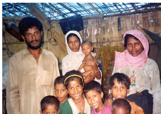
Muslim family - one of the minority groups in the camps

TBBC's 2010 report on Protracted Displacement & Chronic Poverty in Eastern Burma/Myanmar can be downloaded from our website at www.tbbc.org with copies available at TBBC offices.