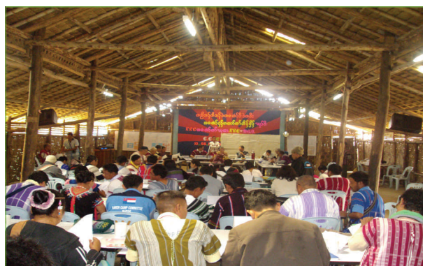
Annual KRC meeting in Umpiem camp