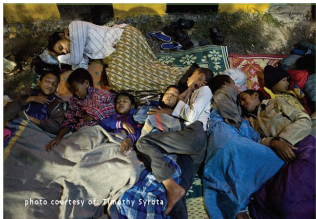
New arrivals at the Three Pagodas Pass

Over 60,000 people have been resettled since 2006.