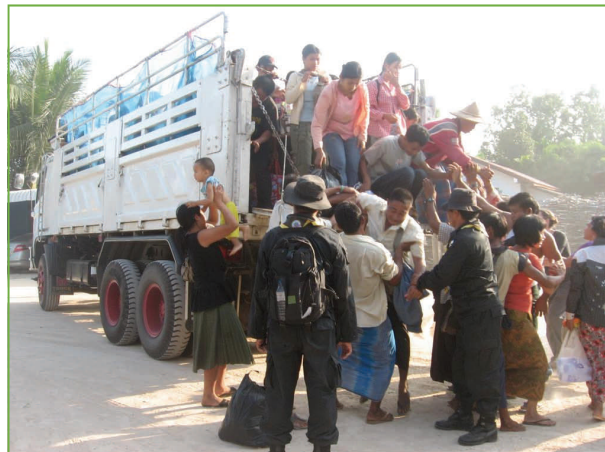
New arrivals at the Three Pagodas Pass

So far this emergency has not affected other parts of the border and has required only a short-term response. However, it is unclear how things will evolve politically in eastern Burma in the coming weeks and months, and there remains the possibility of more refugees and a protracted situation. TBBC staff are on increased alert to deal with any new emergencies as they arise.